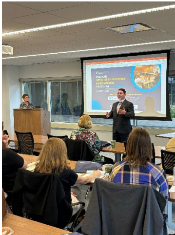
AAEI Chicago Benchmarking Roadshow

This year, AAEI launched its first series of Benchmarking Roadshows, offering an exclusive in-person platform for both AAEI members and non-members to delve into and exchange insights on top trade issues. These discussions focused on key issues such as NextGen Customs, Forced Labor compliance, environmental trade adherence, emerging technologies, and the role of a trade compliance department within a corporate structure.