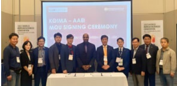
KOIMA-AAEI MOU Signing Ceremony

In August of 2023, AAEI signed a memorandum of understanding (MOU) with the Korea Importers Association (KOIMA), aimed at strengthening trade relations, facilitating knowledge exchange, and encouraging mutual business opportunities between members of KOIMA and AAEI. This alliance aims to advocate for policies supporting fair trade while addressing obstacles hindering