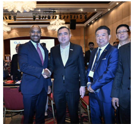
Malaysian Shippers Conference in Petaling Jaya, Malaysia September 2023