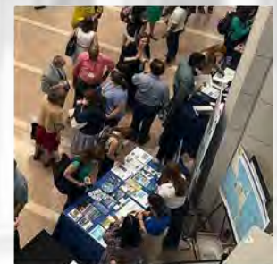
Examples of similar event held Spring 2024